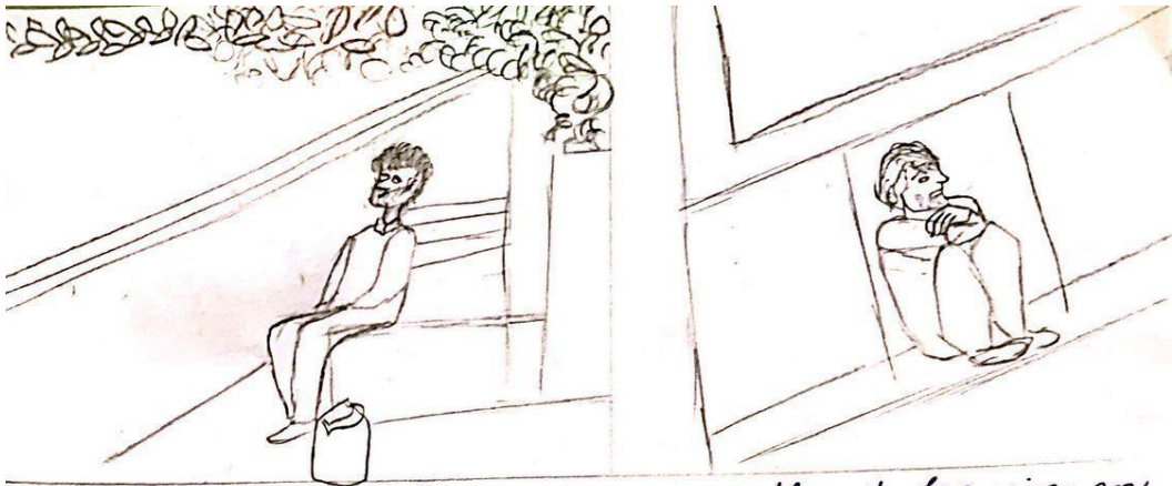
Ahmed sitting on Bus stop Wide Shot + Medium shot