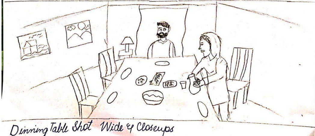
Dinning Table Shot Wide & Closeups