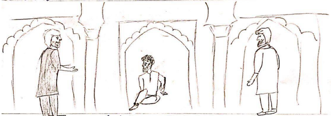
Soul scene: Wide & extreme Closeups