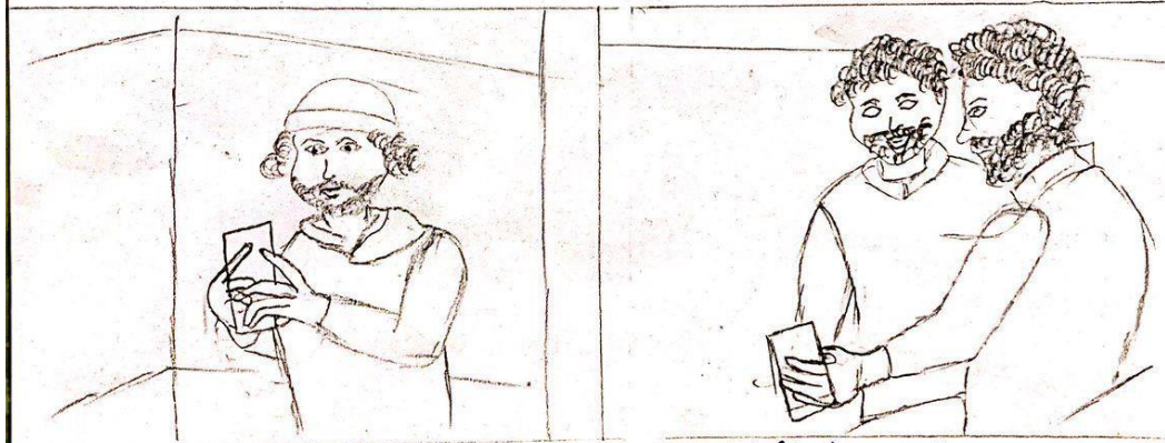
Stranger capturing Ahmed's dance